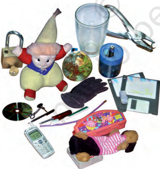
Fig. 2.1 Objects around us

Look around and identify objects that are round in shape. Our list may include a rubber ball, a football and a glass marble. If we include objects that are nearly round, our list could also include objects like apples, oranges, and an earthen pitcher ( gharha ).