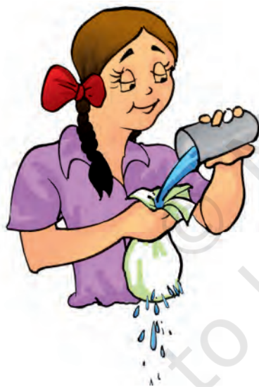
Fig. 2.2 Using a cloth tumbler

We see then, that we choose a material to make an object depending