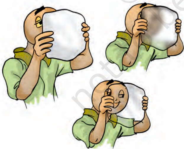
Fig. 2.7 Looking through opaque, transparent or translucent material

You might have played the game of hide and seek. Think of some places where you would like to hide so that you are not seen by others. Why did you choose those places? Would you have tried to