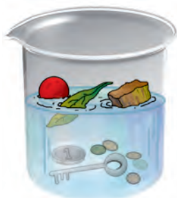
Fig. 2.6 Some objects float in water while others sink in it

drops of honey that you let fall into a glass of water. What happens to all of these?