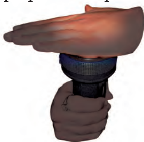
Fig. 2.9 Does torch light pass through your palm?

We can therefore group materials as opaque, transparent and translucent.