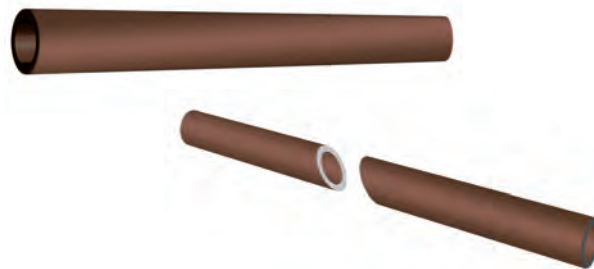
Fig. 2.3 Cutting pieces of materials to see if they have lustre

Do you notice such a shine or lustre in the other materials, cut them anyway as you can? Repeat this in the class with as many materials as possible and make a list of those with and without lustre. Instead of cutting, you can rub the surface of material with sand paper to see if it has lustre.