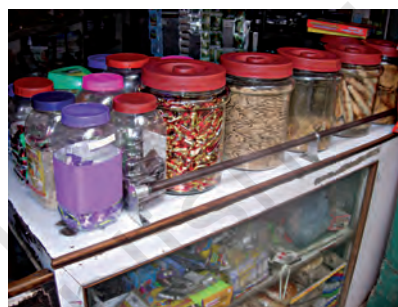
Fig. 2.8 Transparent bottles in a shop

hide behind a glass window? Obviously not, as your friends can see through that and spot you. Can you see through all the materials? Those substances or materials, through which things can be seen, are called transparent (Fig. 2.7). Glass, water, air and some plastics are examples of transparent materials. Shopkeepers usually prefer to keep biscuits, sweets and other eatables in transparent containers of glass or