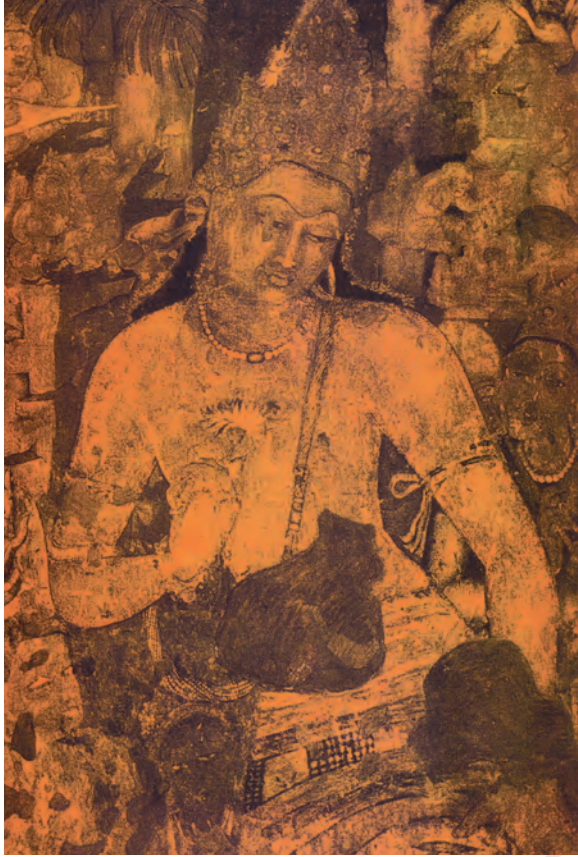
Paintings from Ajanta. Describe what you see in each of these paintings.

chance to visit any of these buildings, remember how several hundreds of people probably worked to construct and decorate them.