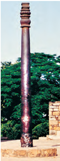
The iron pillar

date because there is an inscription on the pillar mentioning a ruler named Chandra, who probably belonged to the Gupta dynasty (Chapter 9). What is amazing is the fact that the pillar has not rusted through the centuries.