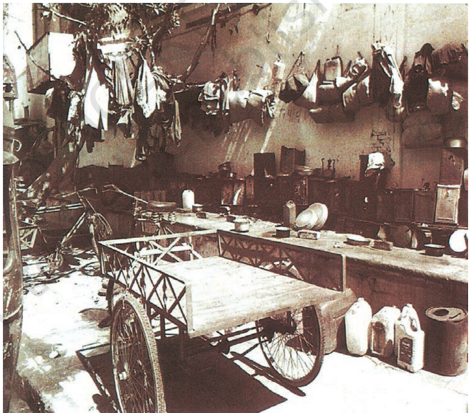
Often workers who make a living in the city are forced to set up their homes on the street as well. Below is a space where several workers leave their belongings during the day and cook their meals at night.

Vendors sell things that are often prepared at home by their families who purchase, clean, sort and make them ready to sell. For example, those who sell food or snacks on the street, prepare most of these at home.