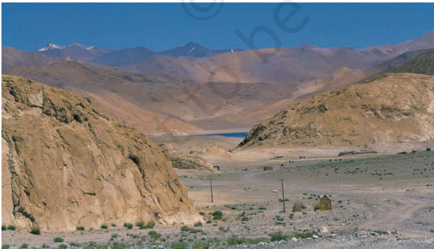
The dry barren landscape of the mountainous desert of Ladakh.

Ladakh is a desert in the mountains in the east of Jammu and Kashmir. Very little agriculture is possible here since this region does not receive any rain and is covered in snow for a large part of the year. There are very few trees that can grow in the region. For drinking water, people depend on the melting snow during the summer months.