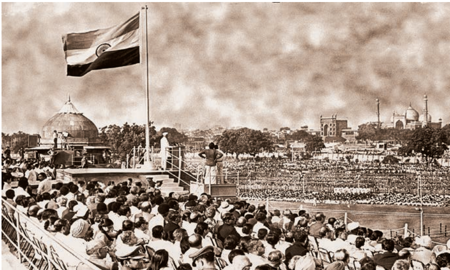
Pt. Nehru delivering an Independence Day speech

Songs and symbols that emerged during the freedom struggle serve as a constant reminder of our country's rich tradition of respect for diversity. Do you know the story of the Indian flag? It was used as a symbol of protest against the British by people everywhere.