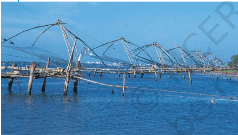
Chinese Fishing Nets

The fishing nets used here look exactly like the Chinese fishing nets and are called cheena-vala. Even the utensil used for frying is called the cheenachatti, and it is believed that the word cheen could have come from China. The fertile land and climate are suited to growing rice and a majority of people here eat rice, fish and vegetables.