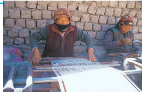
Woman weaving a pashmina shawl

Buddhism reached Tibet via Ladakh. Ladakh is also called Little Tibet. Islam was introduced in this region more than four hundred years ago and there is a significant Muslim population here. Ladakh has a very rich oral tradition of songs and poems. Local versions of the Tibetan national epic the Kesar Saga are performed and sung by both Muslims and Buddhists.