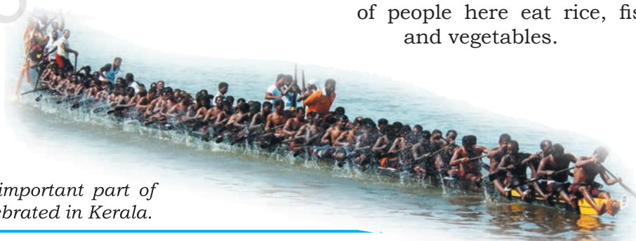
The boat race is an important part of the Onam festival celebrated in Kerala.

an attractive place for traders. Jewish and Arab traders were the first to come here. The Apostle of Christ, St. Thomas is believed to have come here nearly