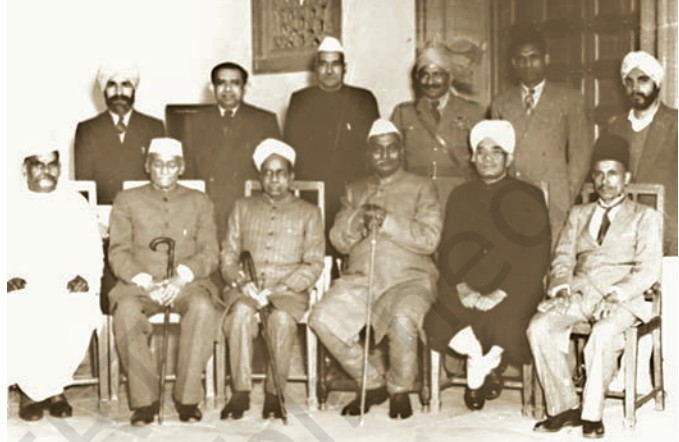
Some of the members who wrote the Constitution of India.

The writers of the Constitution also said that respect for diversity was a significant element in ensuring equality. They felt that people must have the freedom to follow their religion, speak their language, celebrate their festivals and express themselves freely. They