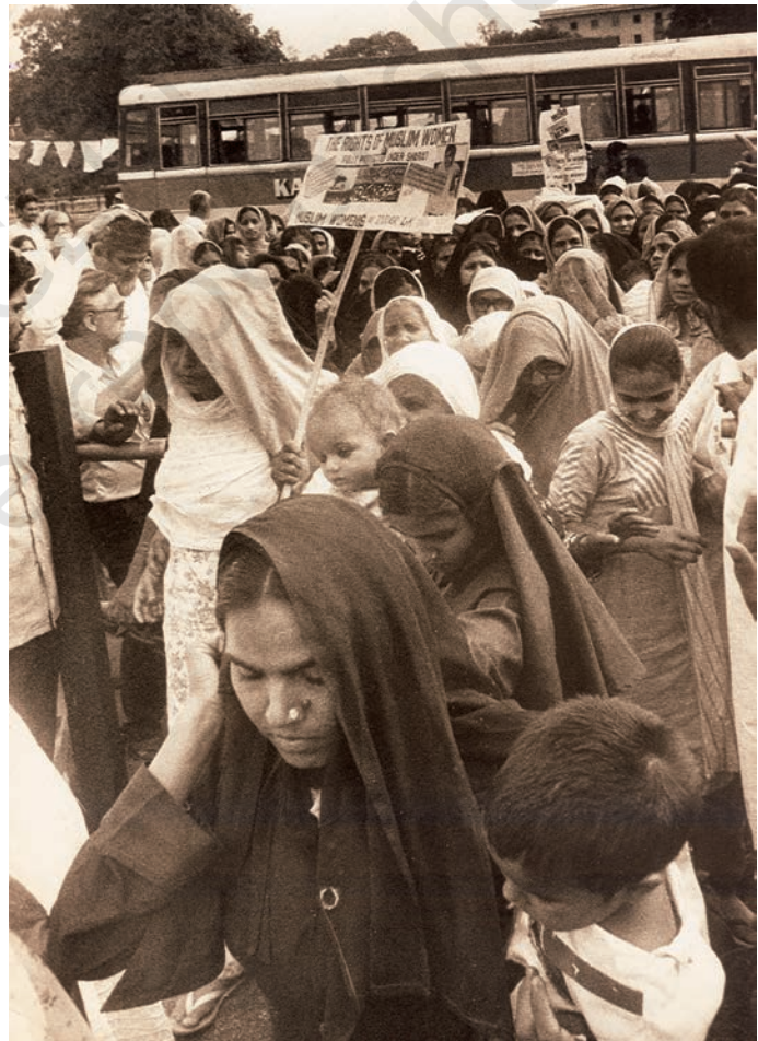
Women at a rally demanding their rights

As pointed out earlier, many Dalits organised themselves to gain entry into temples. Women demanded that they should have as much a right to