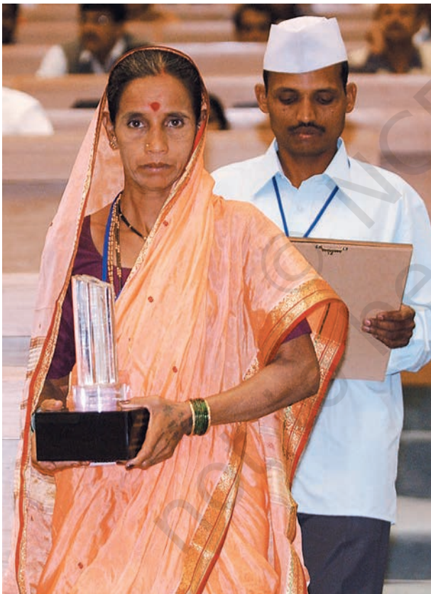
Two village Panchs from Maharashtra who were awarded the Nirmal Gram Puruskar in 2005 for the excellent work done by them in the Panchayat.

In some states, Gram Sabhas form committees like construction and development committees. These committees include some members of the Gram Sabha and some from the Gram Panchayat who work together to carry out specific tasks.