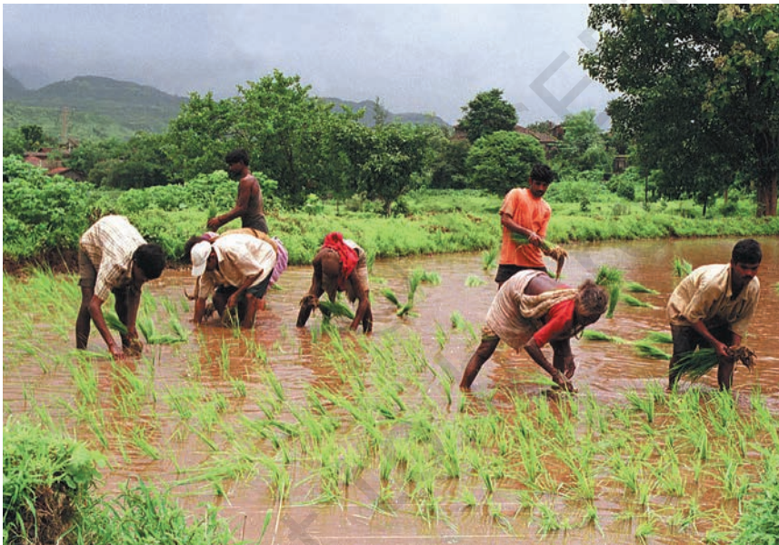
Transplanting paddy is back-breaking work.

The village is surrounded by low hills. Paddy is the main crop that is grown in irrigated lands. Most of the families earn a living through agriculture.