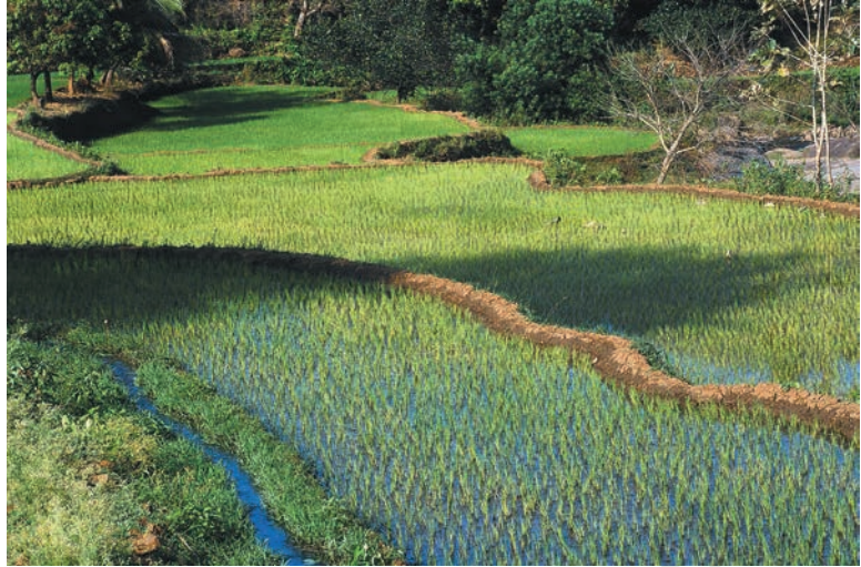
Transplanted paddy growing in a few of Ramalingam's 20 acres. A result of hard labour performed by agricultural workers like Thulasi.

This is when we can say they are caught in debt. In recent years this has become a major cause of distress among farmers. In some areas this has also resulted in many farmers committing suicide.