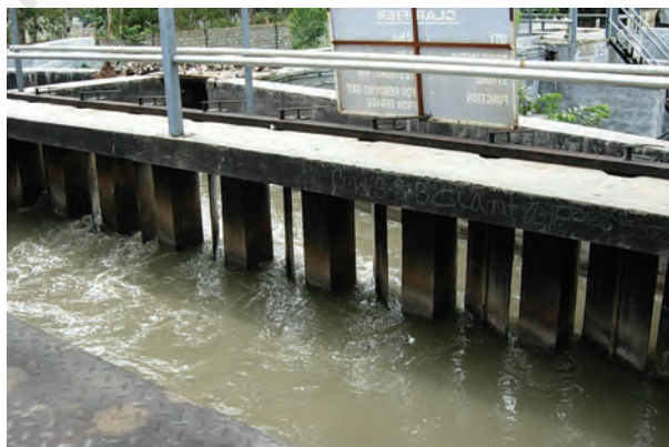
Fig. 13.4 Grit and sand removal tank