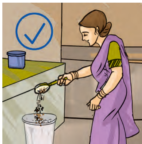
Fig. 13.7 Do not throw everything in the sink