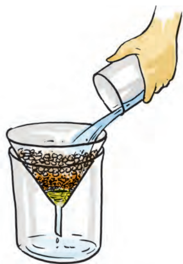
Fig. 13.2 Filtration process