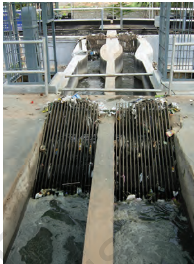
Fig. 13.3 Bar screen