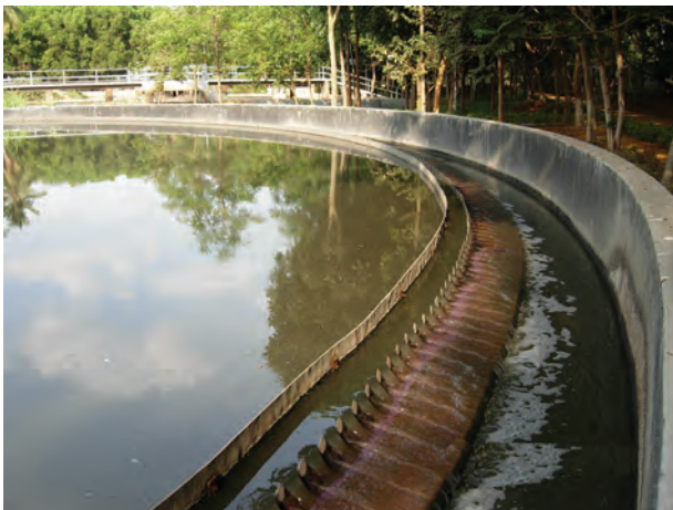
Fig. 13.5 Water clarifer

a scraper. This is the sludge . A skimmer removes the floatable solids like oil and grease. Water so cleared is called clarified water (Fig. 13.5).