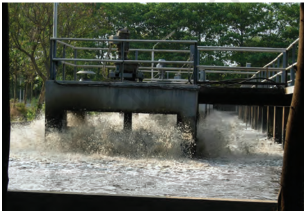
Fig. 13.6 Aerator

4. Air is pumped into the clarified water to help aerobic bacteria to grow. Bacteria consume human waste, food waste, soaps and other unwanted matter still remaining in clarified water (Fig. 13.6).