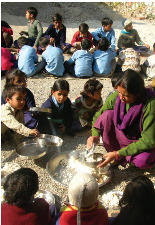
Children being served their midday meal at a government school in Uttarakhand.

What is the midday meal programme? Can you list three benefits of the programme? How do you think this programme might help promote greater equality?