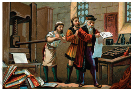
An artist's impression of Gutenberg printing the first sheet of the Bible.

Look at the collage on the left and list six various kinds of media that you see.