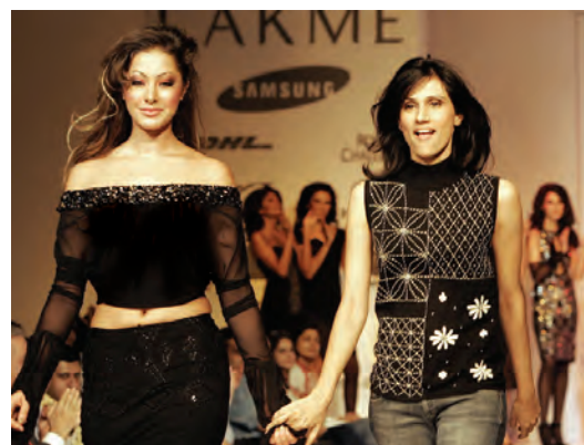
Fashion shows are very popular with the media.

As citizens of a democracy, the media has a very important role to play in our lives because it is through the media that we hear about issues related