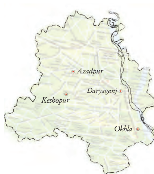
The above map of Delhi shows four of the 10 wholesale markets in the city.