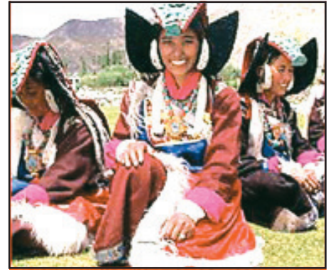
Fig. 7.6: Ladakhi Women in Traditional Dress

Life of people is undergoing change due to modernisation. But the people of Ladakh have over the centuries learned to live in balance and harmony with nature. Due to scarcity of resources like water and fuel, they are used with reverence and care. Nothing is discarded or wasted.