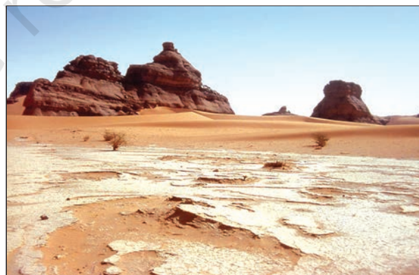
Fig. 7.1: The Sahara Desert

When you think of a desert the picture that immediately comes to your mind is that of sand. But besides the vast stretches of sands, that Sahara desert is covered with, there are also gravel plains and elevated plateaus with bare rocky surface. These rocky surfaces may be more than 2500m high at some places.