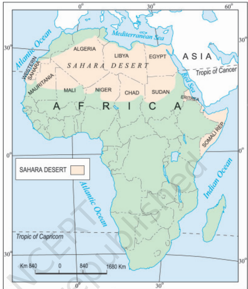
Fig. 7.2: Sahara in Africa

You will be surprised to know that present day Sahara once used to be a lush green plain. Cave paintings in Sahara desert show that there used to be rivers with crocodiles. Elephants, lions, giraffes, ostriches, sheep, cattle and goats were common animals. But the change in climate has changed it to a very hot and dry region.