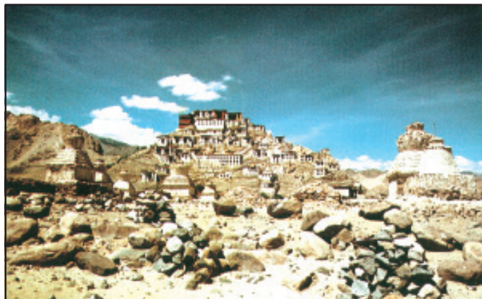
Fig. 7.5: Thiksey Monastery

The finest cricket bats are made from the wood of the willow trees.