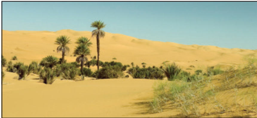
Fig. 7.3: Oasis in the Sahara Desert

snakes and lizards are the prominent animal species living there.