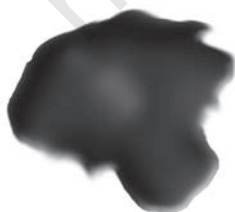
Fig. 3.3: Coal tar

It is a black, thick liquid (Fig. 3.3) with an unpleasant smell. It is a mixture of