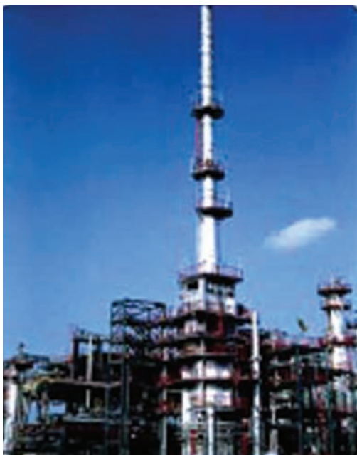
Fig. 3.5: A petroleum refinery

separating the various constituents/ fractions of petroleum is known as refining. It is carried out in a petroleum refinery (Fig. 3.5).