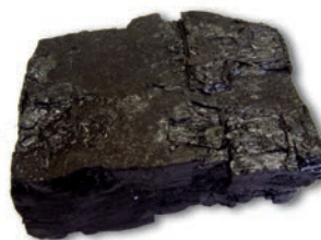
Fig. 3.1: Coal

You may have seen coal or heard about it (Fig. 3.1). It is as hard as stone and is black in colour.