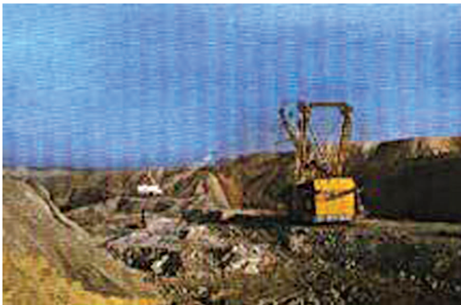
Fig. 3.2: A coal mine

When heated in air, coal burns and produces mainly carbon dioxide gas.