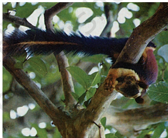
Fig. 5.3 (b) : Giant squirrel

endemic flora of the Pachmarhi Biosphere Reserve. Bison, Indian giant squirrel [Fig. 5.3 (b)] and flying squirrel are endemic fauna of this area. Professor Ahmad explains that the destruction of their habitat, increasing population and introduction of new species may affect the natural habitat of endemic species and endanger their existence.