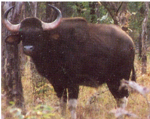
Fig. 5.5 : Wild buffalo

buffaloes (Fig. 5.5) and barasingha (Fig. 5.6) were also found in the Satpura National Park. Animals whose numbers are diminishing to a level that they might face extinction are known as the endangered animals . Boojho is reminded of the dinosaurs which became extinct a long time ago. Survival of some