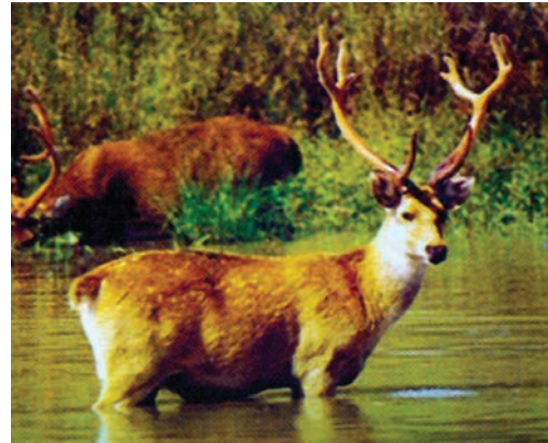
Fig. 5.6 : Barasingha

animals has become difficult because of disturbances in their natural habitat. Professor Ahmad tells them that in order to protect plants and animals strict rules are imposed in all National Parks. Human activities such as grazing, poaching, hunting, capturing of animals or collection of firewood, medicinal plants, etc. are not allowed