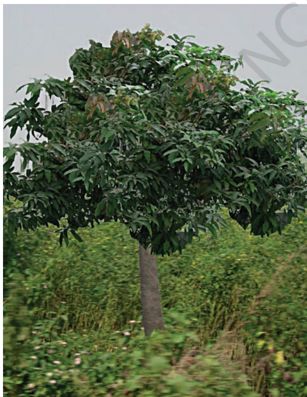
Fig. 5.3 (a) : Wild Mango

Madhavji shows sal and wild mango (Fig. 5.3 (a)) as two examples of the