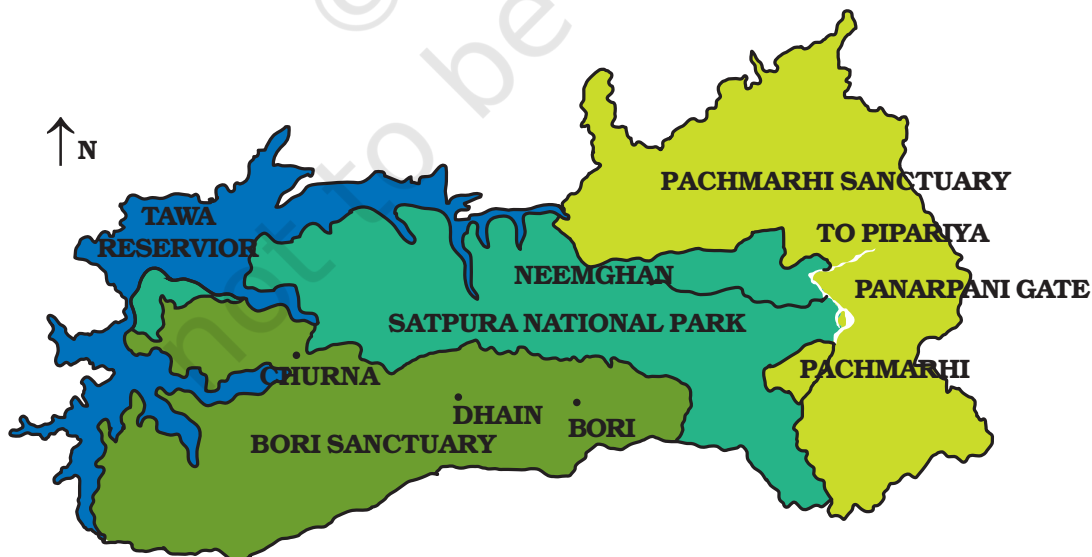
Fig. 5.1 : Pachmarhi Biosphere Reserve