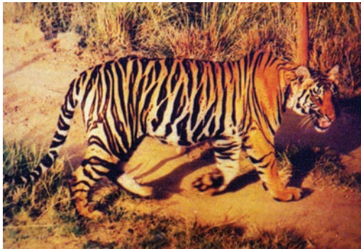
Fig. 5.4 : Tiger

Tiger (Fig. 5.4) is one of the many species which are slowly disappearing from our forests. But, the Satpura Tiger Reserve is unique in the sense that a significant increase in the population of tigers has been seen here. Once upon a time, animals like lions, elephants, wild