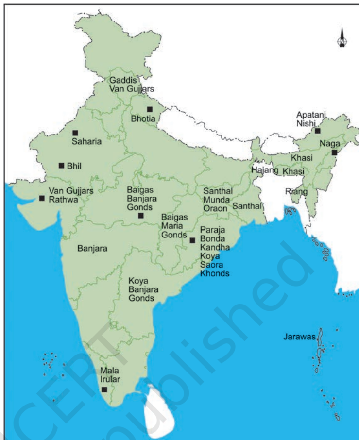
Fig. 3 – Location of some tribal groups in India

Many tribal groups lived by herding and rearing animals. They were pastoralists who moved with their herds of cattle or sheep according to the seasons. When the grass in one place was exhausted, they moved to another area. The Van Gujjars of the Punjab hills and the Labadis of Andhra Pradesh were cattle herders, the Gaddis of Kulu were shepherds, and the Bakarwals of Kashmir reared goats. You will read more about them in your history book next year.