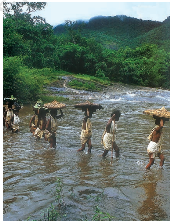
Fig. 1 – Women of the Dongria Kandha tribe in Orissa wade through the river on the way to the market

You have read about tribal societies last year. Most tribes had customs and rituals that were very different from those laid down by Brahmans. These societies also did not have the sharp social divisions that were characteristic of caste societies. All those who belonged to the same tribe thought of themselves as sharing common ties of kinship. However, this did not mean that there were no social and economic differences within tribes.