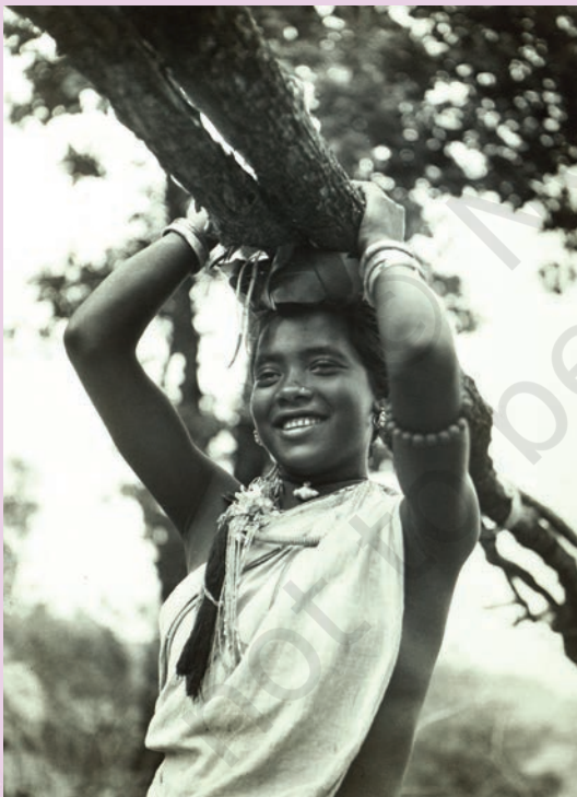
Fig. 4 – A Santhal girl carrying firewood, Bihar, 1946

Adapted from Verrier Elwin, Baiga (1939) and Elwin's unpublished 'Notes on the Khonds' (Verrier Elwin Papers, Nehru Memorial Museum and Library)