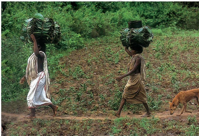
Fig. 2 – Dongria Kandha women in Orissa take home pandanus leaves from the forest to make plates

Mahua – A flower that is eaten or used to make alcohol