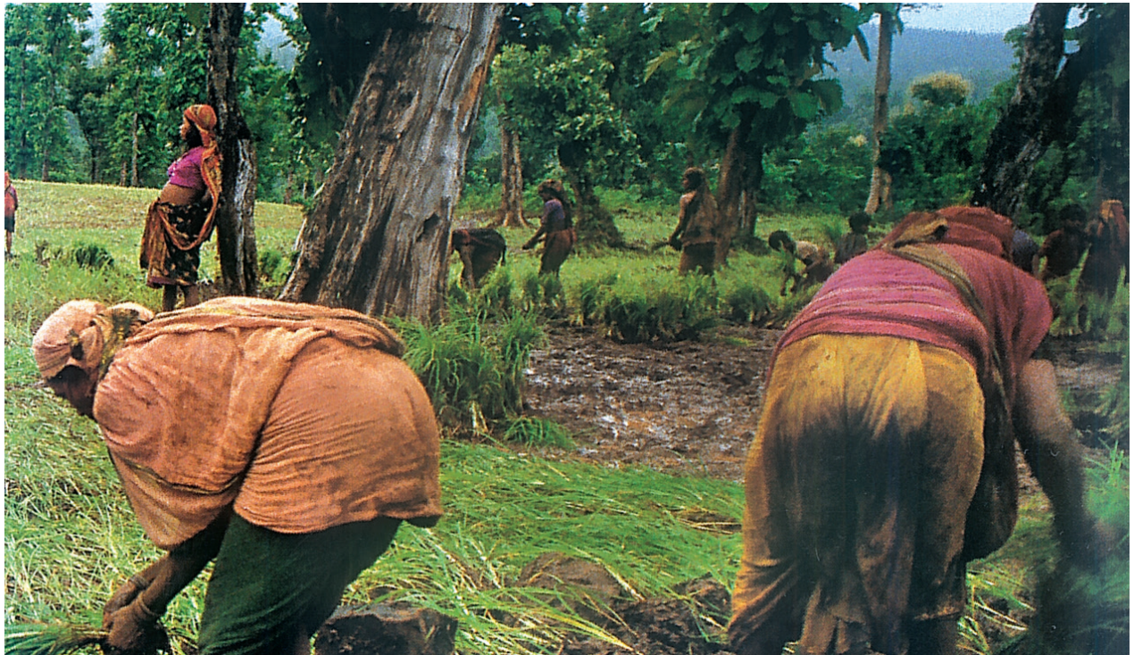
Fig. 6 – Bhil women cultivating in a forest in Gujarat

Shifting cultivation continues in many forest areas of Gujarat. You can see that trees have been cut and land cleared to create patches for cultivation.