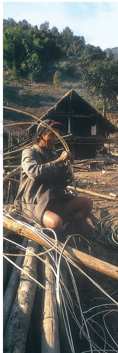
Fig. 5 – A log house being built in a village of the Nyishi tribes of Arunachal Pradesh.

Bewar – A term used in Madhya Pradesh for shifting cultivation