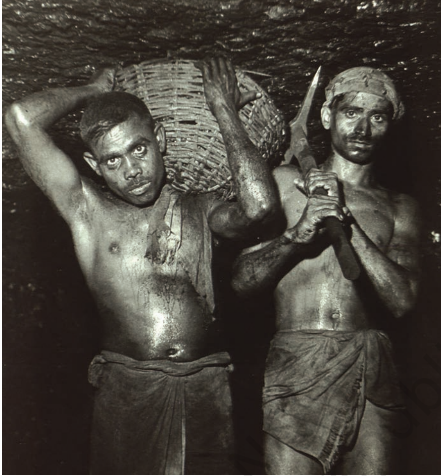
Fig. 10 – Coal miners of Bihar, 1948

In the 1920s, about 50 per cent of the miners in the Jharia and Raniganj coal mines of Bihar were tribals. Work deep down in the dark and suffocating mines was not only back-breaking and dangerous, it was often literally killing. In the 1920s, over 2,000 workers died every year in the coal mines in India.