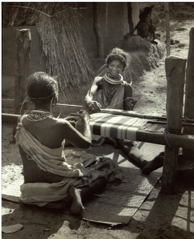
Fig. 8 – Godara women weaving

Many tribal groups reacted against the colonial forest laws. They disobeyed the new rules, continued with practices that were declared illegal, and at times rose in open rebellion. Such was the revolt of Songram Sangma in 1906 in Assam, and the forest satyagraha of the 1930s in the Central Provinces.