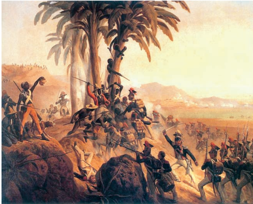
Fig. 7 – The Slave Revolt in St Domingue, August 1791, painting by Januarius Schudowski

In the eighteenth century, French planters produced indigo and sugar in the French colony of St Domingue in the Caribbean islands. The African slaves who worked on the plantations rose in rebellion in 1791, burning the plantations and killing their rich planters. In 1792, France abolished slavery in the French colonies. These events led to the collapse of the indigo plantations on the Caribbean islands.