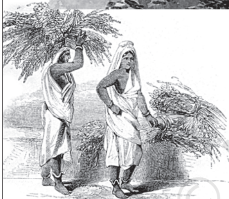
Fig. 11 – Women usually carried the indigo plant to the vats.