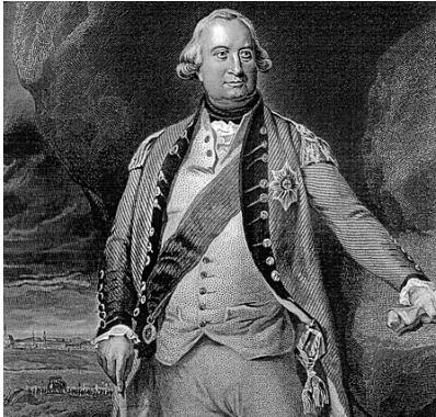
Fig. 3 – Charles Cornwallis Cornwallis was the Governor-General of Bengal when the Permanent Settlement was introduced.