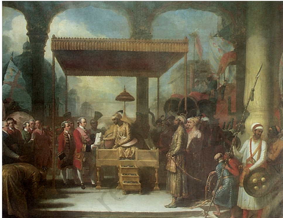
Fig. 1 – Robert Clive accepting the Diwani of Bengal, Bihar and Orissa from the Mughal ruler in 1765