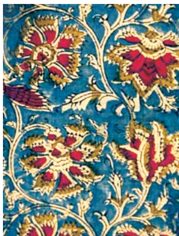
Fig. 5 – A kalamkari print, twentieth-century India

How was this done? The British used a variety of methods to expand the cultivation of crops that they needed. Let us take a closer look at the story of one such crop, one such method of production.