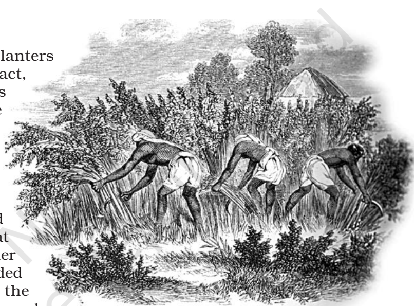
Fig. 8 – Workers harvesting indigo in early-nineteenth-century Bengal. From Colesworthy Grant, Rural Life in Bengal , 1860

Bigha – A unit of measurement of land. Before British rule, the size of this area varied. In Bengal the British standardised it to about one-third of an acre.