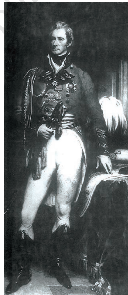
Fig. 4 – Thomas Munro, Governor of Madras (1819–26)

Mahal – In British revenue records, mahal is a revenue estate which may be a village or a group of villages.