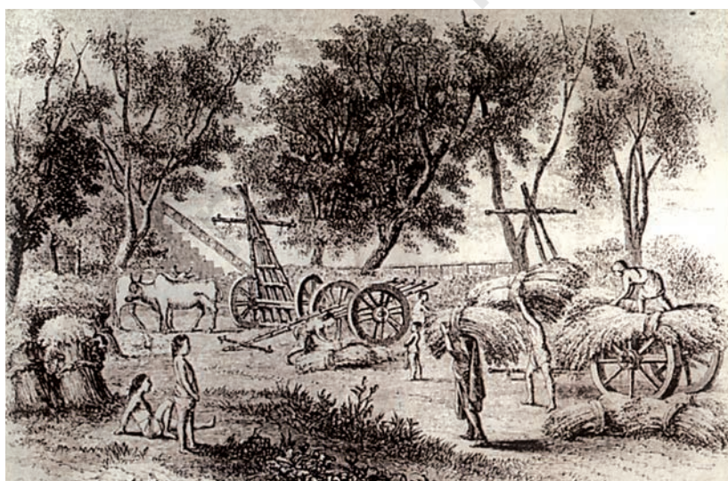
Fig. 9 – The Indigo plant being brought from the fields to the factory

In India the indigo plant was cut mostly by men.