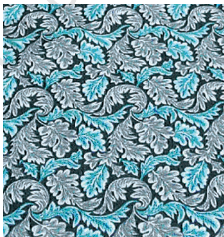
Fig. 6 – A Morris cotton print, late-nineteenth-century England