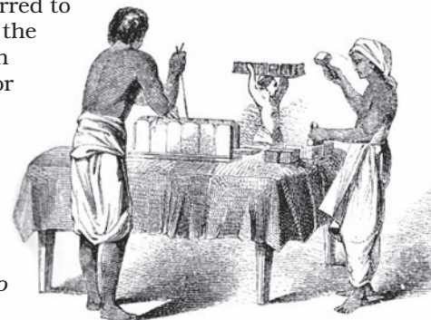
Fig. 13 – The indigo is ready for sale

In the second vat (known as the beater vat), the solution was continuously stirred and beaten with paddles. When the liquid gradually turned green and then blue, lime water was added to the vat. Gradually the indigo separated out in flakes, a muddy sediment settled at the bottom of the vat and a clear liquid rose to the surface. The liquid was drained off and the sediment – the indigo pulp – transferred to another vat (known as the settling vat), and then pressed and dried for sale.