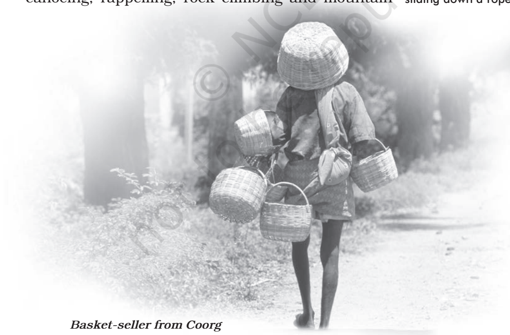
Basket-seller from Coorg