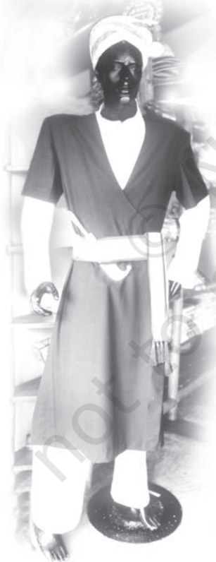
Traditional Coorgi dress

some showers thrown in for good measure. The air breathes of invigorating coffee. Coffee estates and colonial bungalows stand tucked under tree canopies in prime corners.