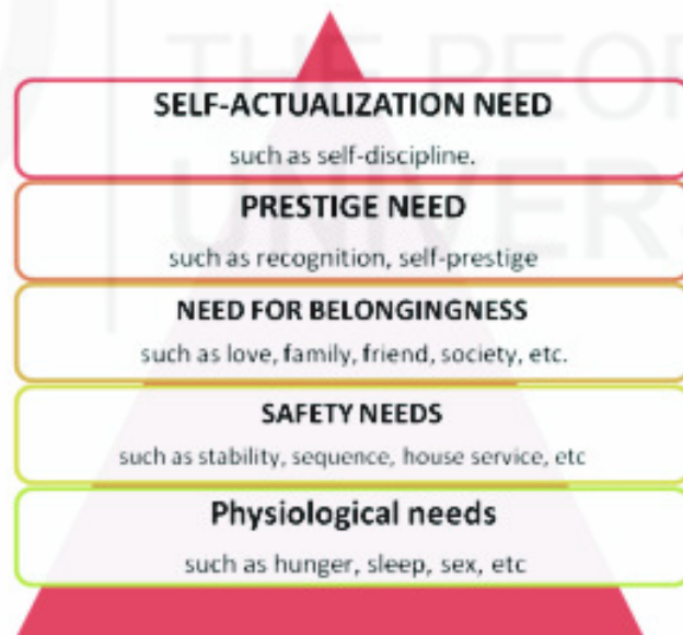
Fig. 2.1: Maslow’s Hierarchy of Needs

Maslow has analyzed five types of needs as given below: