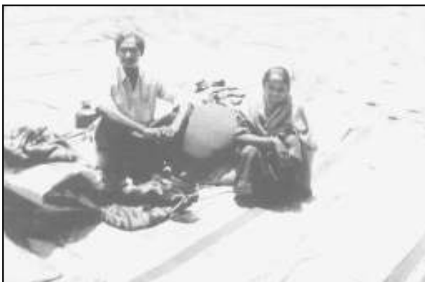
A homeless couple

The facts of contemporary history are also facts about the success and the failure of individual men and women. When a society is industrialised, a peasant becomes a worker; a feudal lord is liquidated or becomes a businessman. When classes rise or fall, a man is employed or unemployed; when the rate of investment goes up or down, a man takes new heart or goes broke. When wars happen, an insurance salesman becomes a rocket launcher; a store clerk, a radar man; a wife lives alone; a child grows up without a father. Neither the life of an individual nor the history of a society can be understood without understanding both... (Mills 1959).