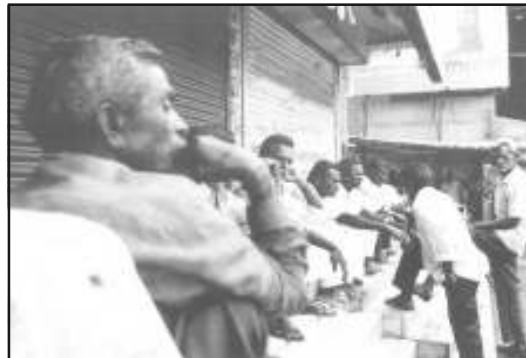
What kind of groups are these?