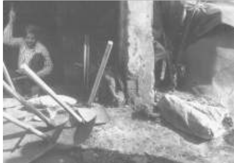
Work and Home