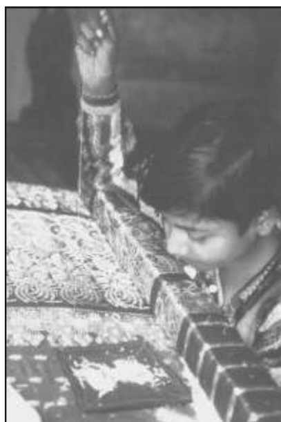
Discuss the visual

The above report indicates how gender and caste discrimination impinges upon the chances of education. Recall how we began this book in Chapter 1 about a child's