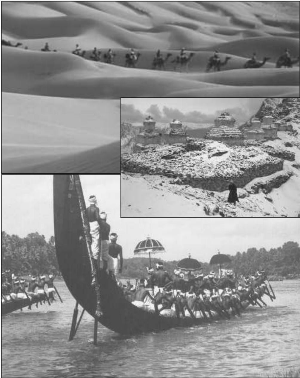
Discuss how natural settings affect culture