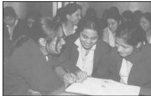
Contrast the two types of group