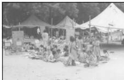
Discuss the visuals