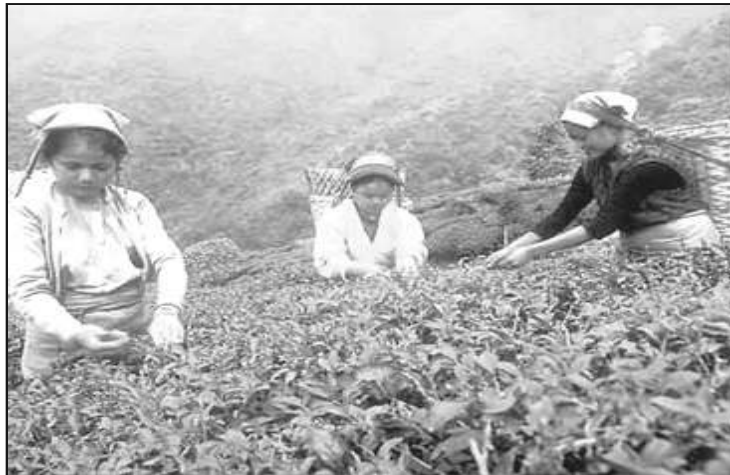
Tea pickers in Assam

Other changes have also redefined the nature of sociology and social anthropology. Modernity as we saw led to a process whereby the smallest village was impacted by global processes. The most obvious example is colonialism. The most remote village of India under British colonialism saw its land laws and administration change, its revenue extraction alter, its manufacturing industries collapse.