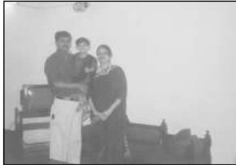
Notice how families and residences are different