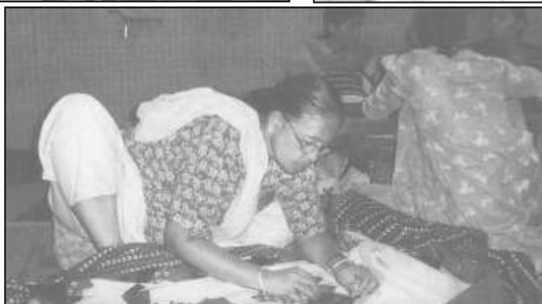
Kind of Works

physical effort, which has as its objective the production of goods and services that cater to human needs.