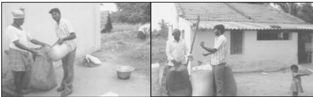
Threshing of paddy in a village