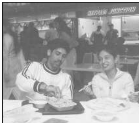
Discuss how the visual capture a way of life

habits acquired by man as a member of society" (Tylor 1871 I:1).