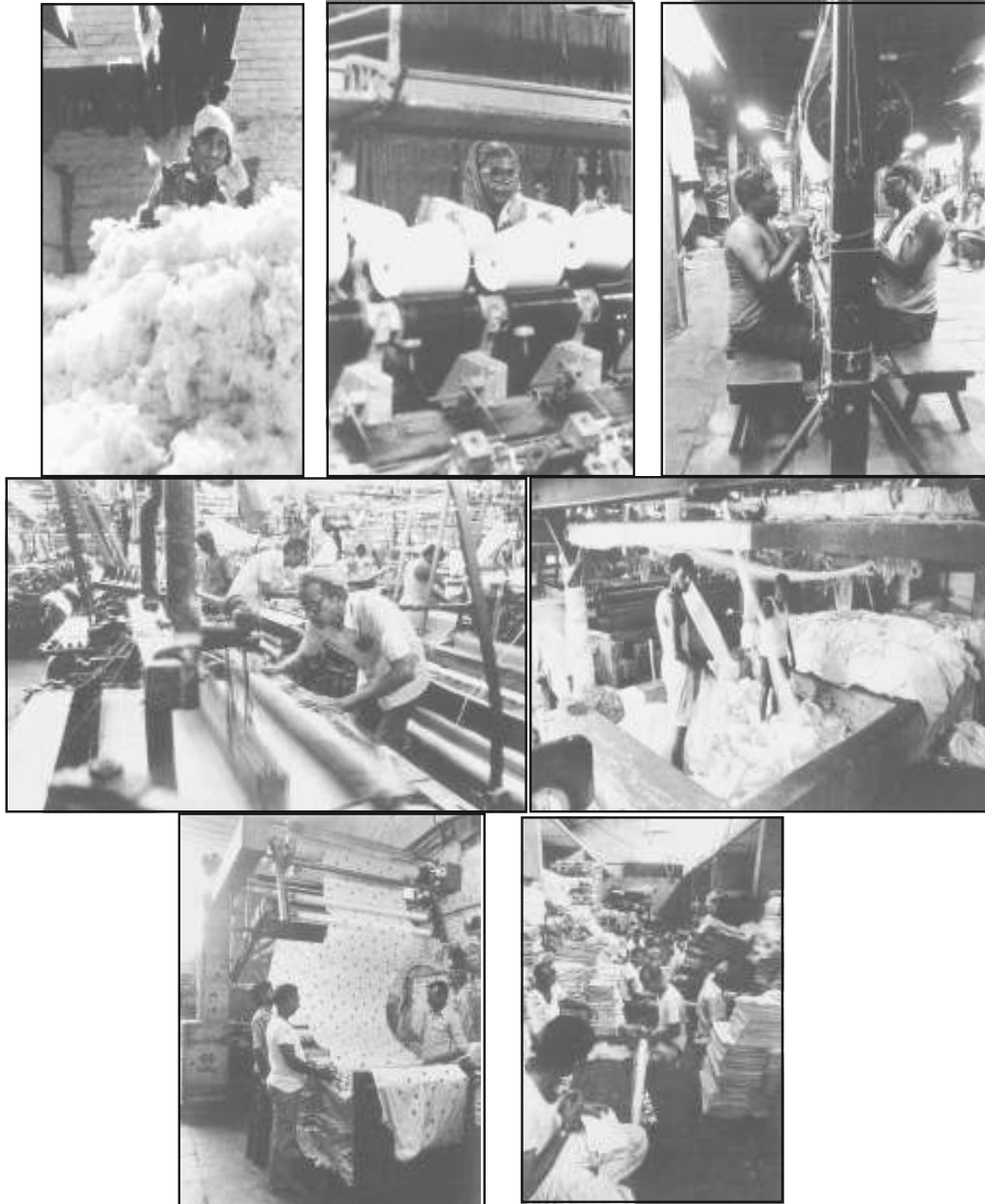
Discuss the two forms of production in the two sets of visuals Cloth production in a factory